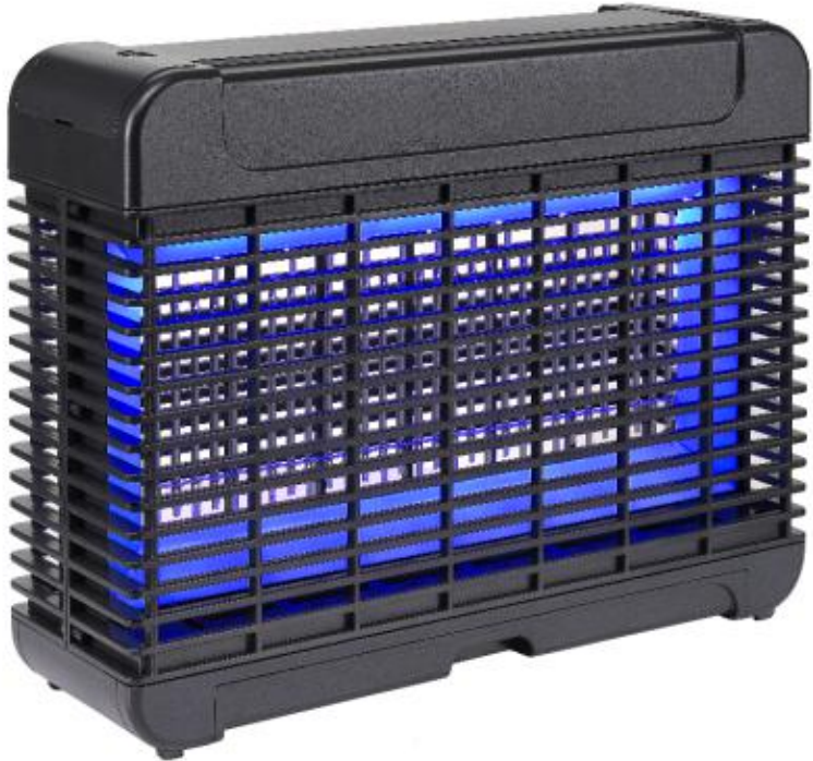
GB-16L/30L Glory Insect Killer