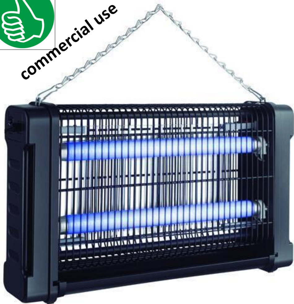
GC2-16 Kingkong Insect Killer