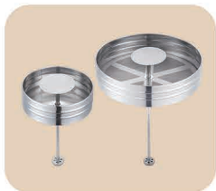
(304SS Coffee basket & pod & dome)