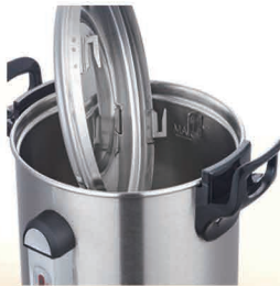
lock system to pass SII drop test