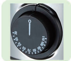
30~110°C Adjustable thermostat