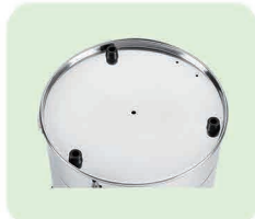
SS bottom and antislip rubber feet