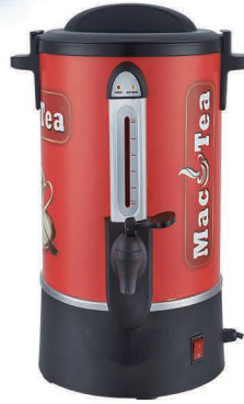
A2 (tea sticker urn)