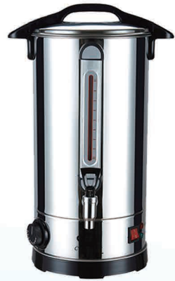
E1,E2 (304SS tap/urn)