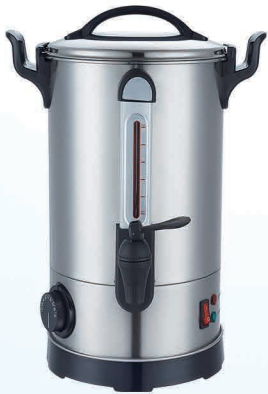
C1,C2 (adjustable thermostat)