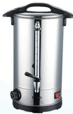
E1,E2 (polished finish, brass chrome coating)