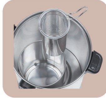
(304 tea pot,tea basket)