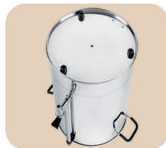
(201SS bottom & metal handle)