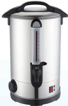
E1,E2 (plastic tap)