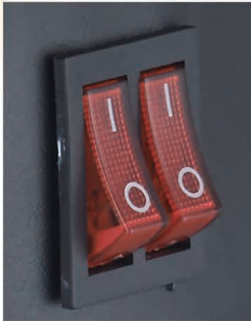
double switch with pilot light