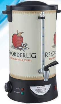
A2 (cider sticker urn)