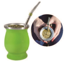
TMPN02 200 M