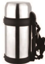
FLGC 1.0 / 1.2 / 1.5 L