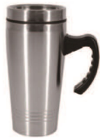
TMAK04 380 ML