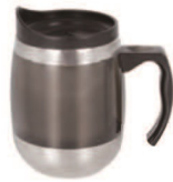
TMG052 400 ML