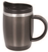
TMG051 400 ML