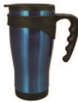
TMTPD04 400 ML