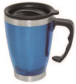
TMGR04 380 ML