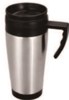
TMG053 400 ML