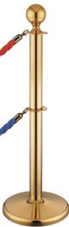
Ø51管双层中圆球 (钛金) 51 tube (Gold) SIZE: 320X51X1050 N.W: 7.2kg