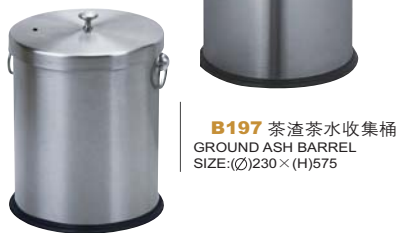
B197 茶渣茶水收集桶 GROUND ASH BARREL SIZE:( \varnothing )230×(H)575