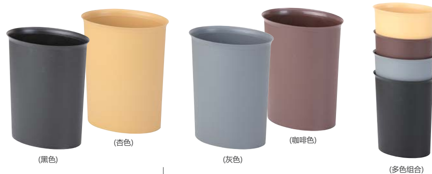
N013 喇叭口椭圆形塑料桶 (10L) ROOM RUBBISH BARREL SIZE:(L)270 x (W)190 x (H)320