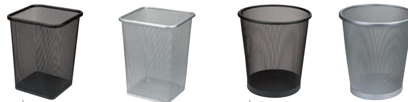
N022 方锥形废纸桶(黑色/银色) ROOM RUBBISH BARREL A:(L)270×(W)270×(H)295 B:(L)250×(W)250×(H)350 C:(L)220×(W)220×(H)300