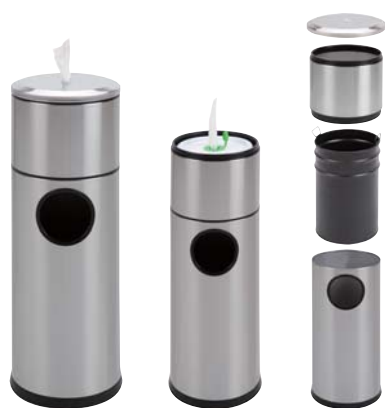
N018 圆形湿纸巾桶 WET TISSUE BUCKET SIZE:( \varnothing )265 x (H)870