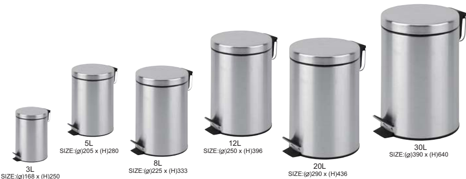
N005 圆形垃圾桶 ROOM RUBBISH BARREL SIZE:5L/8L/9L/12L/20L/30L/50L