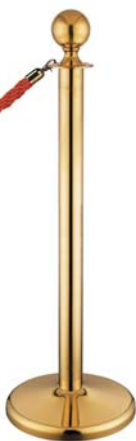
Ø51管中圆球 (钛金) 51 tube (Gold) SIZE: 320X51X1000 N.W: 7.0kg