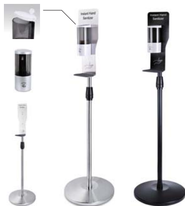
N19 消毒架 DISINFECTION RACK SIZE:(L)383 x (W)155 x (H)843