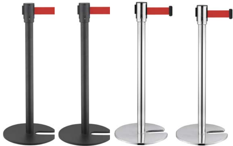
2米烤漆 2 meter iron paint SIZE: 350X51X880 N.W: 8.7kg