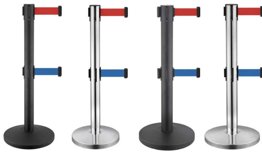
2米双层铁烤漆 2M iron paint SIZE: 320X63X910 N.W: 9.0kg