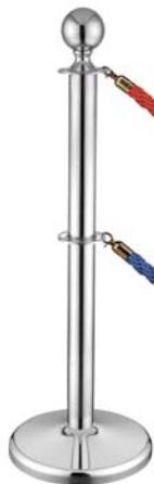
Ø51管双层中圆球 (不锈钢) 51 tube (stainless steel) SIZE: 320X51X1050 N.W: 7.2kg