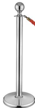
Ø51管中圆球 (不锈钢) 51 tube (stainless steel) SIZE: 320X51X1000 N.W: 7.0kg