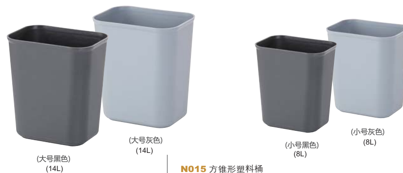
N015 方锥形塑料桶 ROOM RUBBISH BARREL SIZE:(L)280 x (W)195 x (H)315 (大号) SIZE:(L)260 x (W)170 x (H)265 (小号)