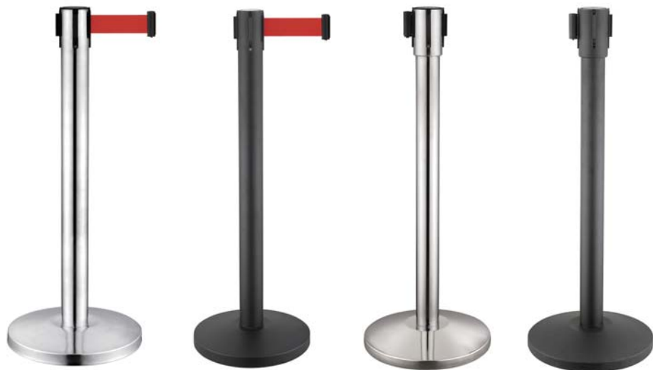
Ø63管2米不锈钢 63 2M SS SIZE: 320X63X910 N.W: 8.2kg