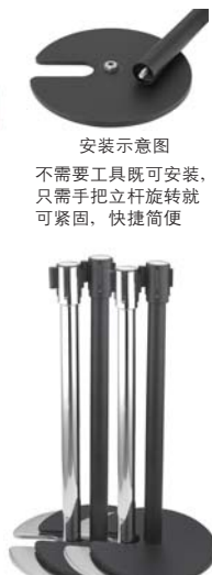
3米不锈钢 3 meter stainless steel SIZE: 350X51X880 N.W: 8.7kg